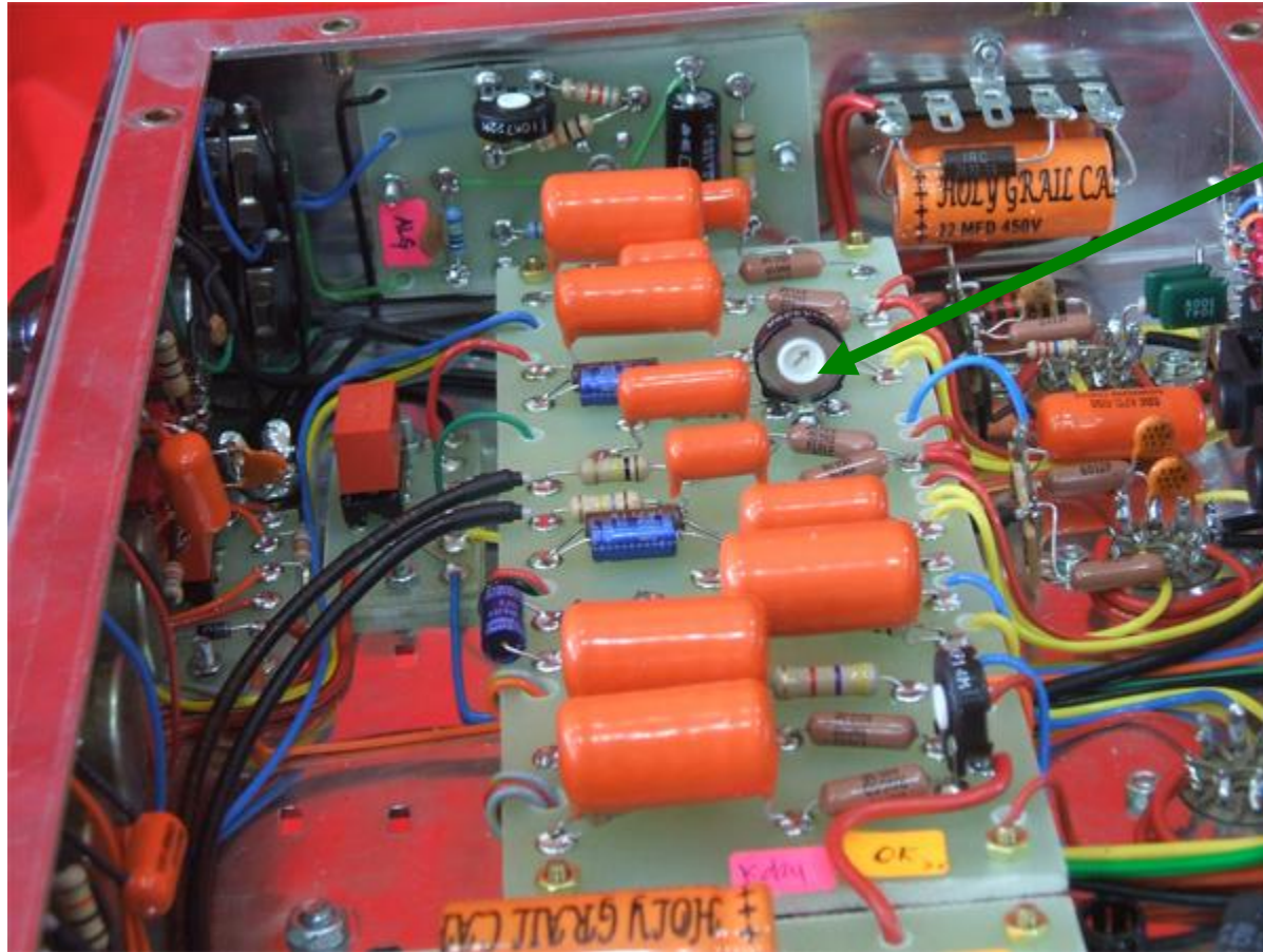
Inside chassis view of OTS 100W. Green arrow indicates OD trimmer.

I've read about something called a PI trimmer inside of the amp. Does the OTS have it, and what does it do?